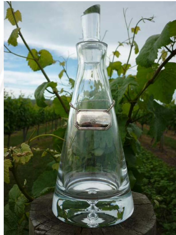
Keltern Single Vineyard Chardonnay 2007